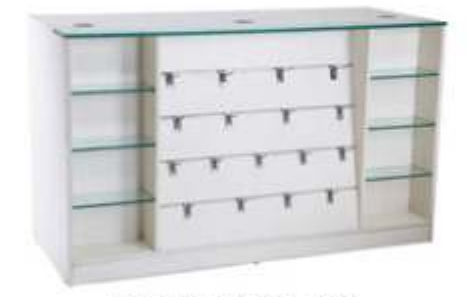
V5-7 Wooden Counter