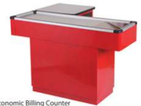
V5-3 Economic Billing Counter