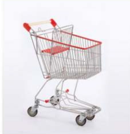
V8-2 Zink Plated Shopping Cart