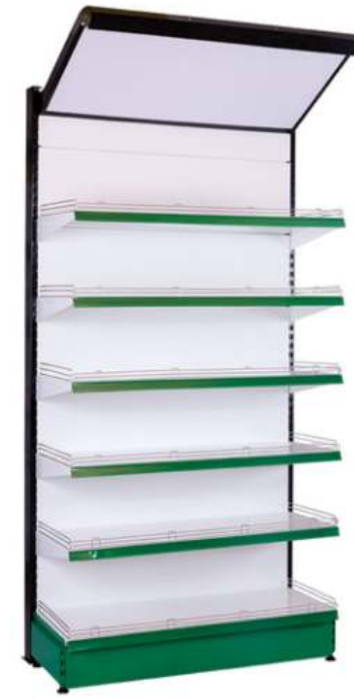
V1-5 End Cap (Face Cap)