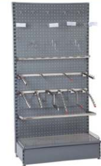
V6-9 Hanging Display