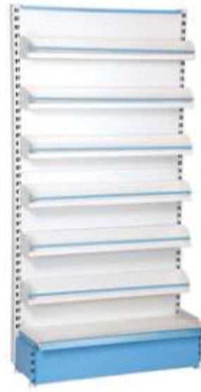
V2-14 CD/ DVD Rack