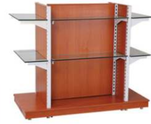
V6-19 Multipurpose Rack