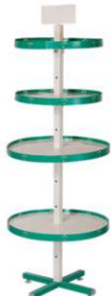
V4-10 Round Rack