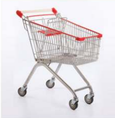
V8-1 Zink Plated Shopping Cart