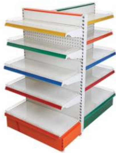
V2-4 Gondola with Face Cap