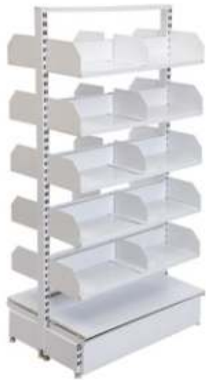
V2-5 Library Rack