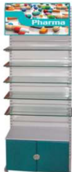
V2-13 Pharmacy Rack