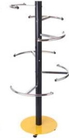
V6-13 Hanger Stand Round