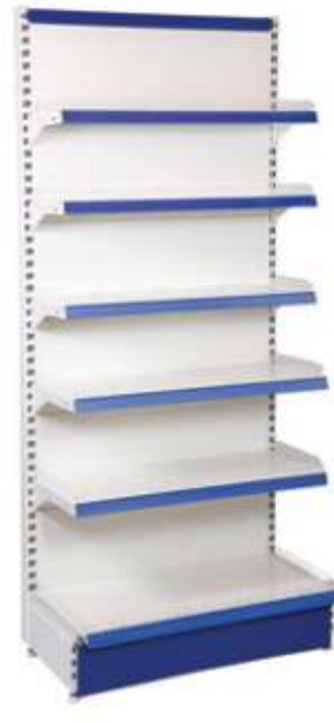
V1-3 Wall Unit