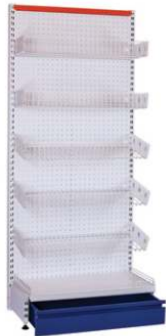
V1-1 Wall unit with wire shelves