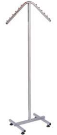
V6-11 Hanger Stand