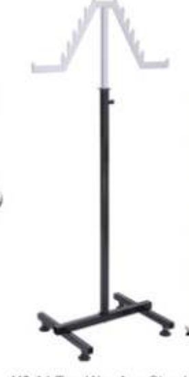
V6-14 Two Way Arm Stand (Adjustable)