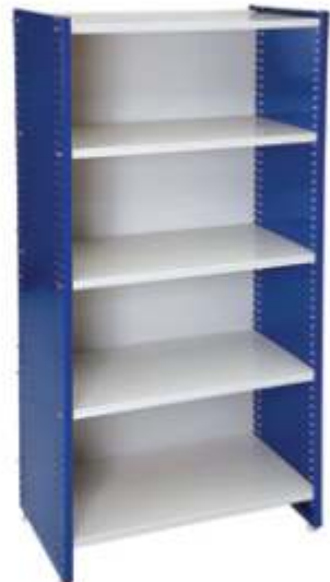
V2-9 Commercial Shelving