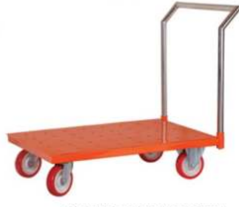
V8-6 Platform Trolley (Heavy Duty)

We are making different types of Trolleys & Baskets as per customers specifications & requirements in various colors & finishes.