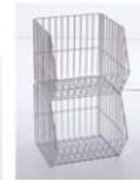
V4-4 Stackable Basket