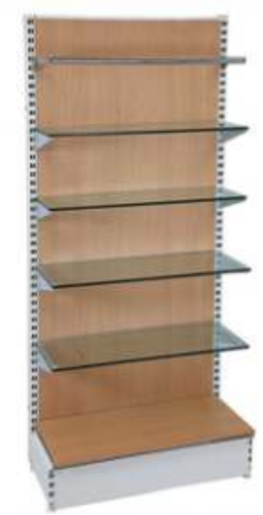
V6-1 Wall unit with PL Back Board