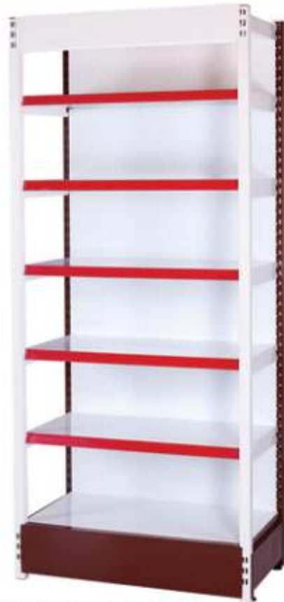
V2-10 Heavy Duty Shelving