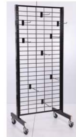
V6-18 Multiple Peg Hook Display