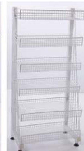
V4-3 Candy/Chocolate Rack