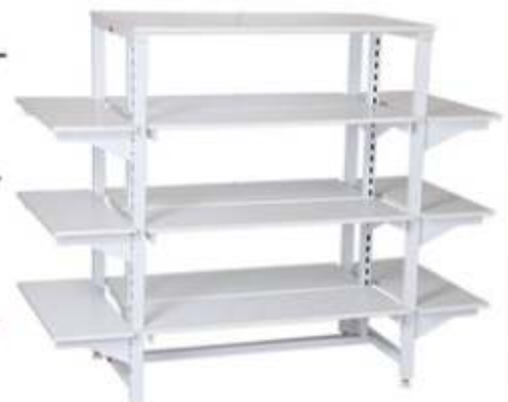
V6-20 'H' Type Rack