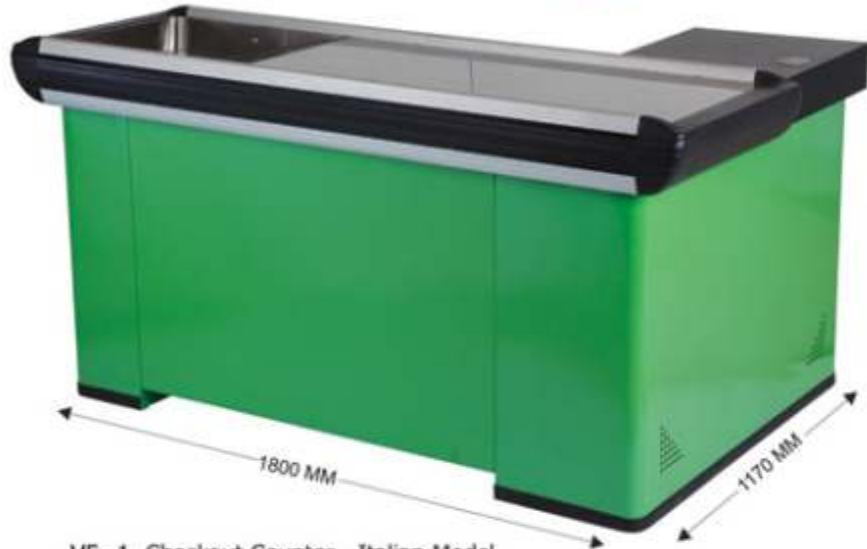
V5-1 Checkout Counter - Italian Model