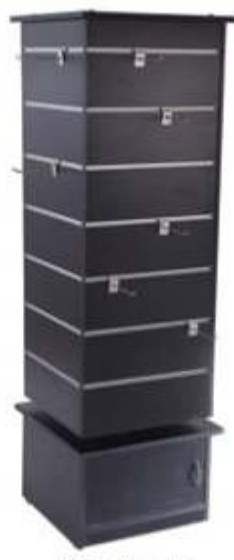
V6-7 Square Revolving Unit