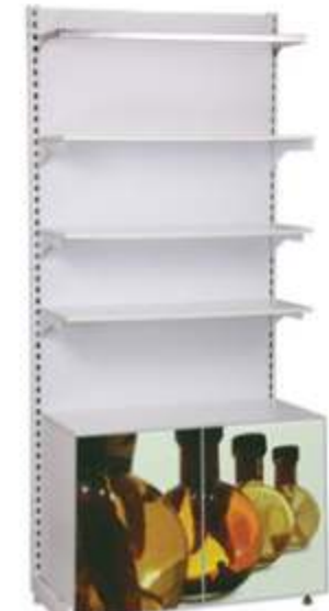
V2-11 Multipurpose Unit