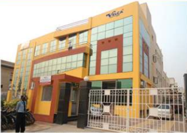
FACTORY AT MANESAR (HR.)