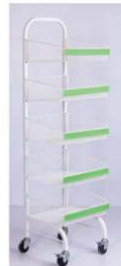
V4-1 Multipurpose Stand