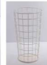
V4-6 Broom Stand