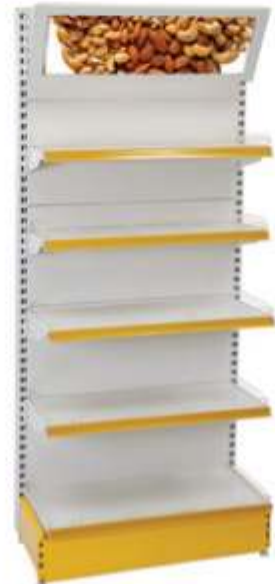
V2-15 Wall Unit with Glow Sign