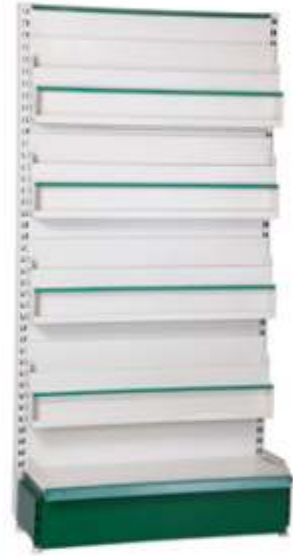
V2-7 Magazine Rack