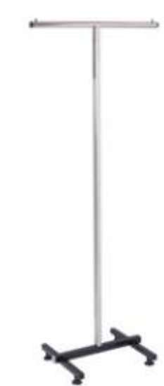
V6-12 Straight Hanger