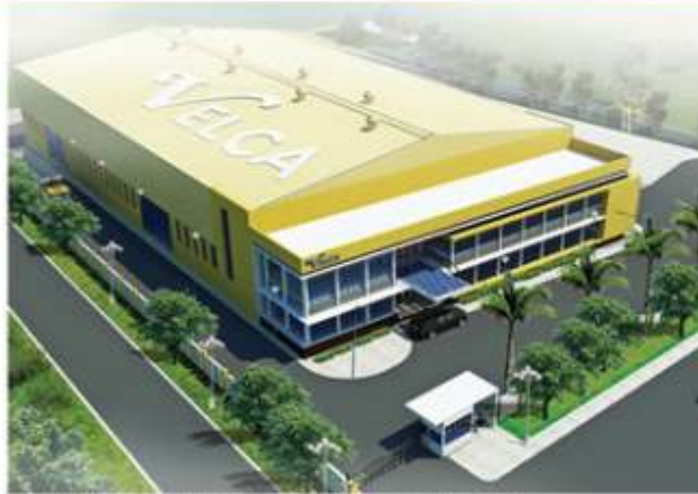
PROPOSED FACTORY AT BANGALORE (81,000 SQ. FT. AREA)