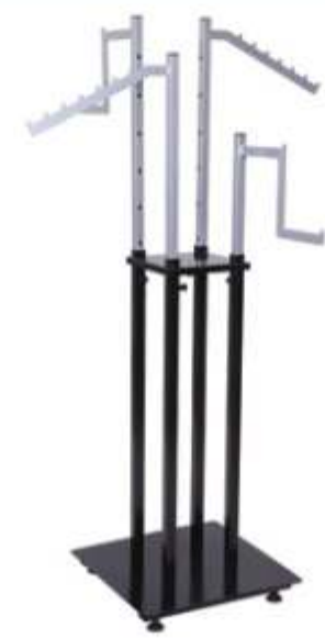
V6-17 Four Way Stand (Adjustable)