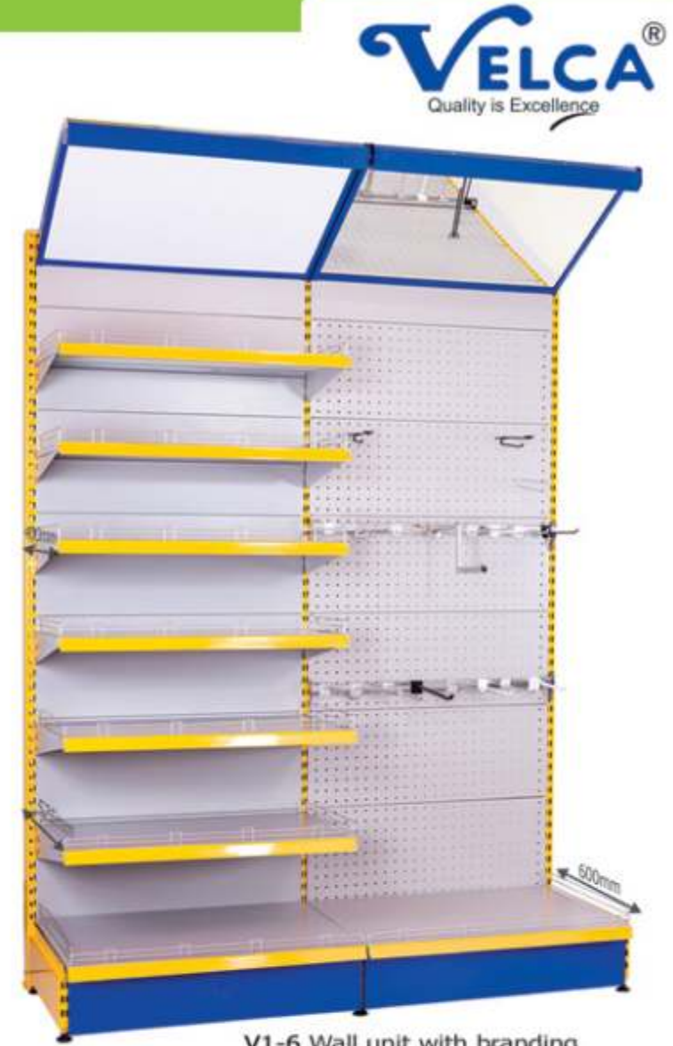
V1-6 Wall unit with branding