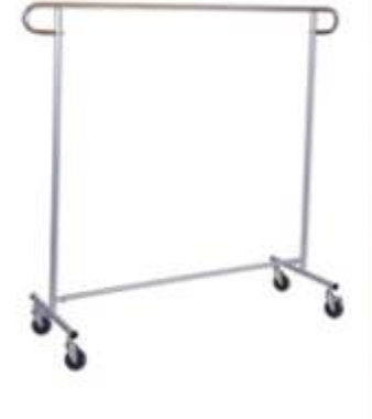
V6-16 Coat Hanger