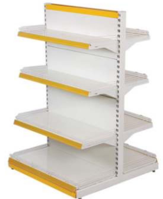
V2-2 Gondola Unit