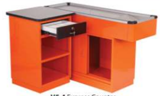
V5-4 Express Counter