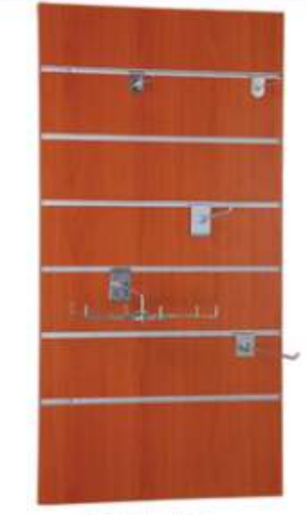
V6-8 Slat Wall