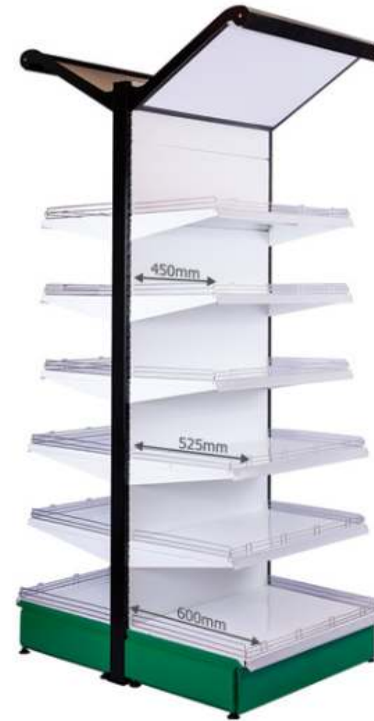
V1-4 Gondola Unit