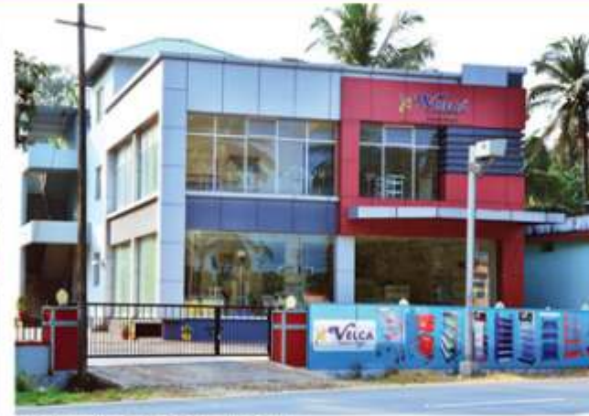
KERALA SHOWROOM - TRICHUR