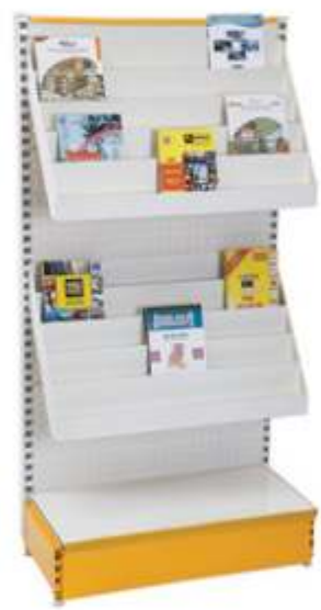
V2-8 Magazine Rack