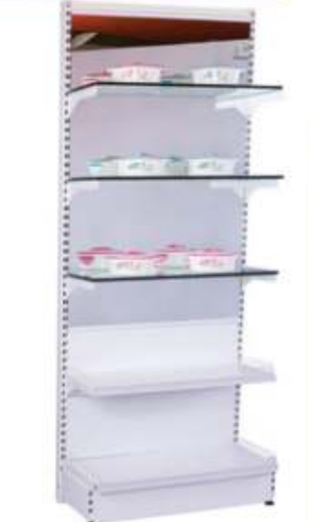
V6-10 Wall Unit With Mirror Display