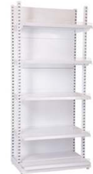
V2-6 Heavy Duty - 2 Tier