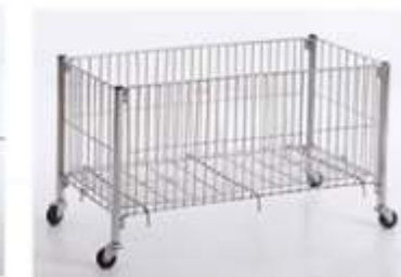
V4-5 Multipurpose Basket