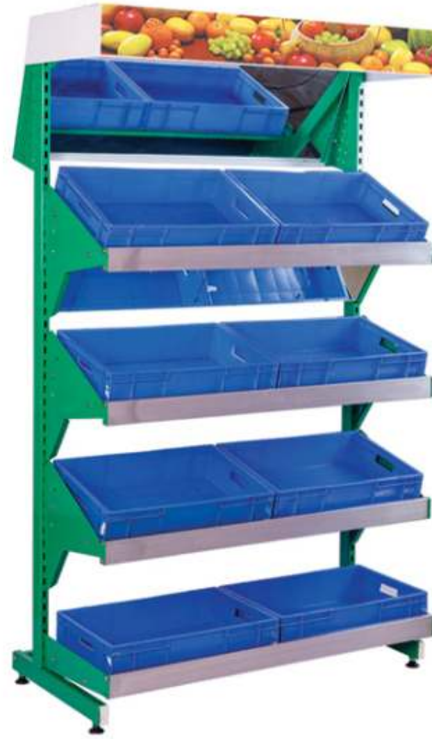
V3-1 F & V Unit with Plastic Crates