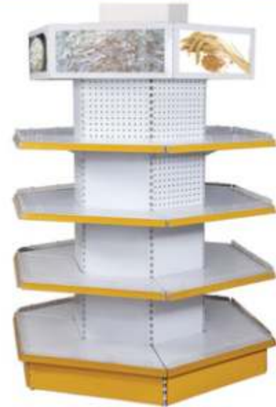
V2-3 Polygon Rack