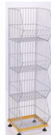
V4-2 Alligator stand