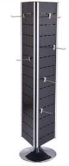
V6-4 Tri-angle Revolving Unit