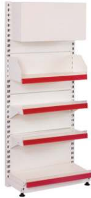
V1-2 Display unit with branding frame