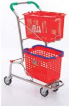
V8-4 Basket Trolley