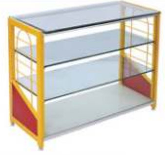
V5-8 Display counter