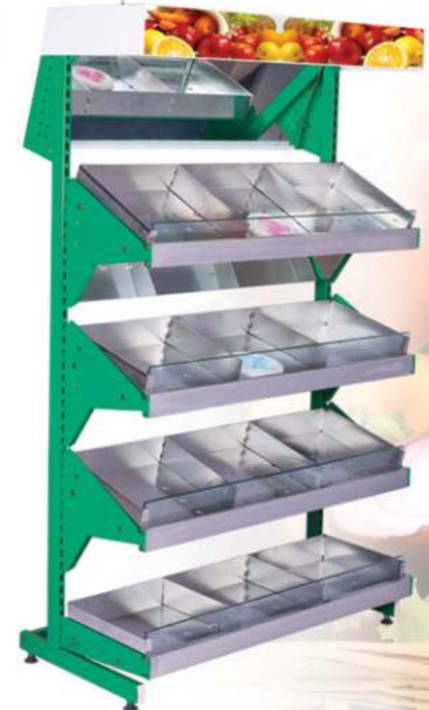
V3-3 F & V Unit with SS (304) Trays