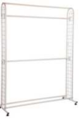
V6-15 Multiple Hanger Display