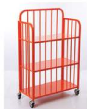
V4-8 Multipurpose Rack with Wheel