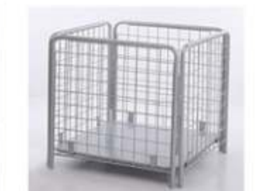
V4-7 Bin Basket