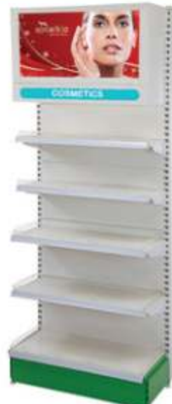
V2-12 Cosmetic Unit