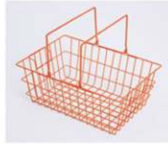
V8-3 Shopping Basket