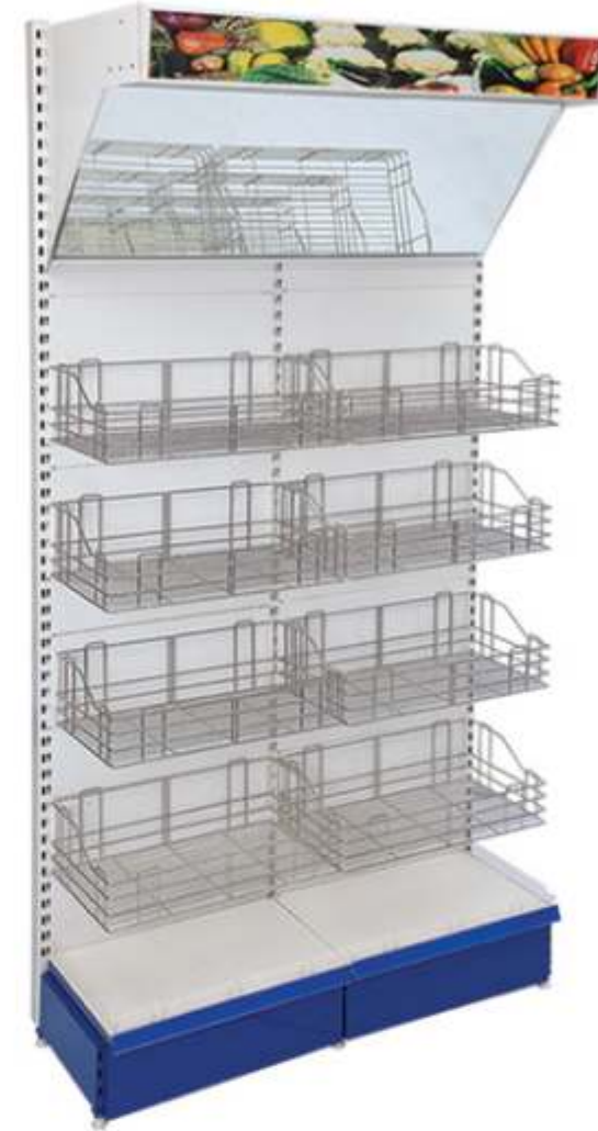
V3-2 F & V Unit with SS Wire Basket